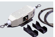
MN-100 ANTENNA MATCHER Match the transceiver to a dipole antenna without applying DC power. 8 m×2 antenna wires come attached.