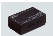
CT-17 CI-V LEVEL CONVERTER For remote transceiver control from a PC equipped with an RS-232C port.