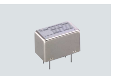
CR-338 HIGH STABILITY CRYSTAL UNIT Contains a temp. compensating heater for improved frequency stability. Frequency stability: ±0.5 ppm