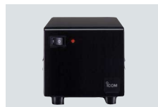
PS-85 DC POWER SUPPLY Output: 13.8 V DC (20 A max.)