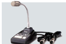
SM-8 DESKTOP MICROPHONE Equipped with 2 connection cables. [UP]/[DOWN] switches are included.