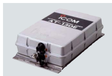
AT-130/E HF AUTOMATIC ANTENNA TUNER Covers 1.6–30 MHz with a 7 m (23 ft) or longer wire antenna.