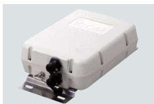
AH-4 AUTOMATIC ANTENNA TUNER Covers 3.5–30 MHz with a 7 m (23 ft) or longer wire antenna.