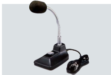
SM-6 DESKTOP MICROPHONE Electret condenser-type desktop microphone.