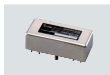
455 kHz FILTERS Have good shape factor and provide you with better reception.