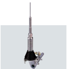
AH-2b ANTENNA ELEMENT For mobile operation with the AH-4. All bands between 7–30 MHz can be matched.