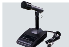
SM-20 DESKTOP MICROPHONE High quality desktop microphone. Includes [UP]/[DOWN] switches and low cut function.