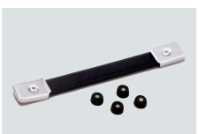
MB-23 CARRYING HANDLE For easy portability.