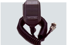
HM-36 HAND MICROPHONE Same as that supplied.