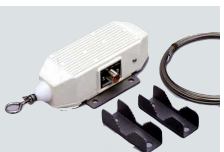
MN-100L ANTENNA MATCHER Match the transceiver to a long-wire antenna without applying DC power. 15 m×1 antenna wire comes attached.